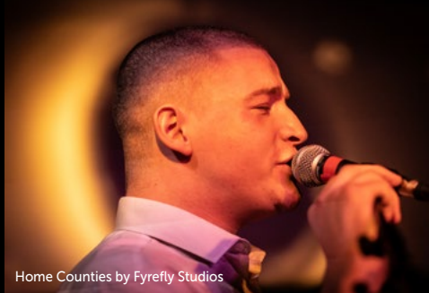
Home Counties

Wednesdays are boring. Neither early enough in the week to still be drunk from the weekend just passed, nor close enough to the next one to get your tummy feeling all funny. No, Wednesdays are dull and Wednesdays are stupid. Unless of course you find yourself at a midweek show like this one.